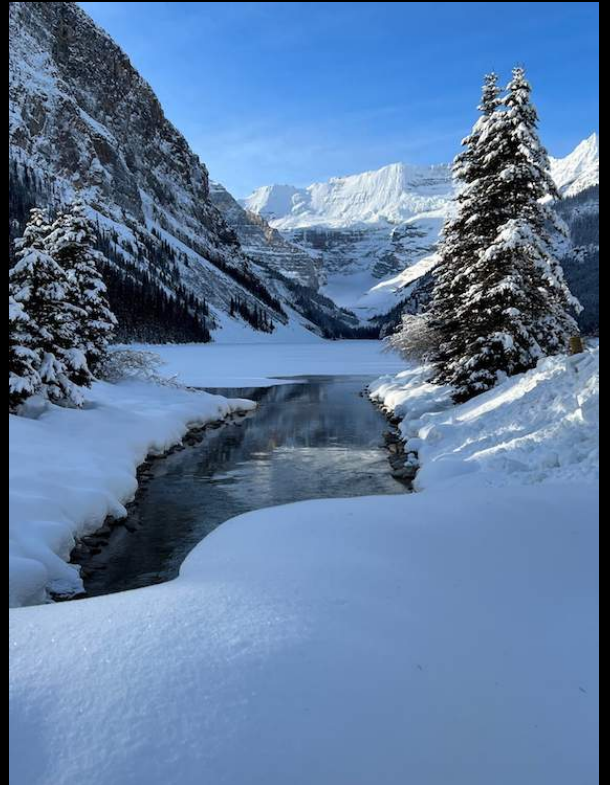
Lynda Corkum Lake Louise in winter 3 rd place Advanced 85.3 points