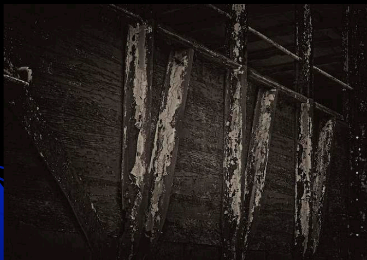
Katherine Beaumont Old railway car 1 st place Novice 67 points