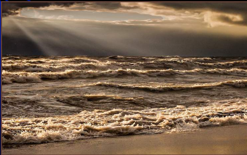
Norm Rheaume Waves 3 rd place Advanced 81.7 points