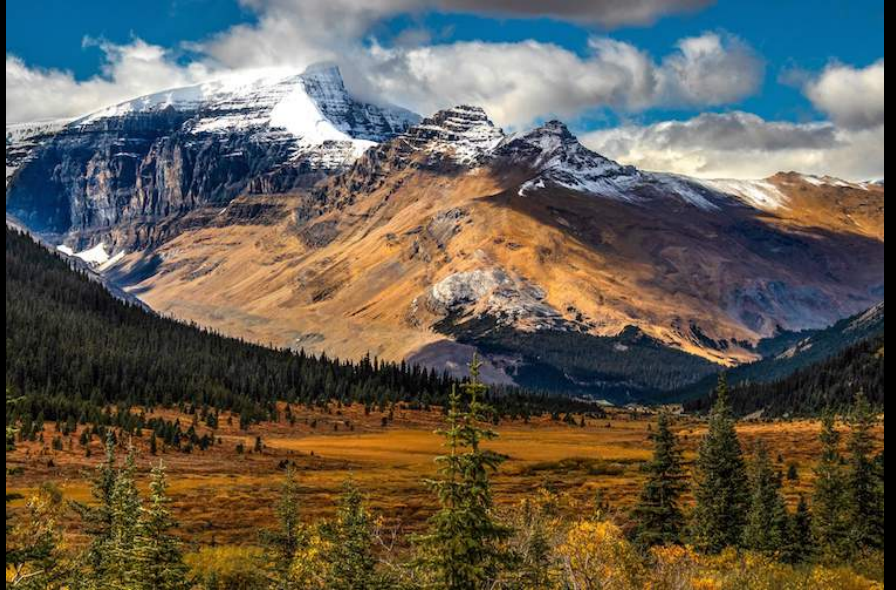
Alan Defoe Sunwapta Pass Mountains 3 rd place Advanced 83.7 points