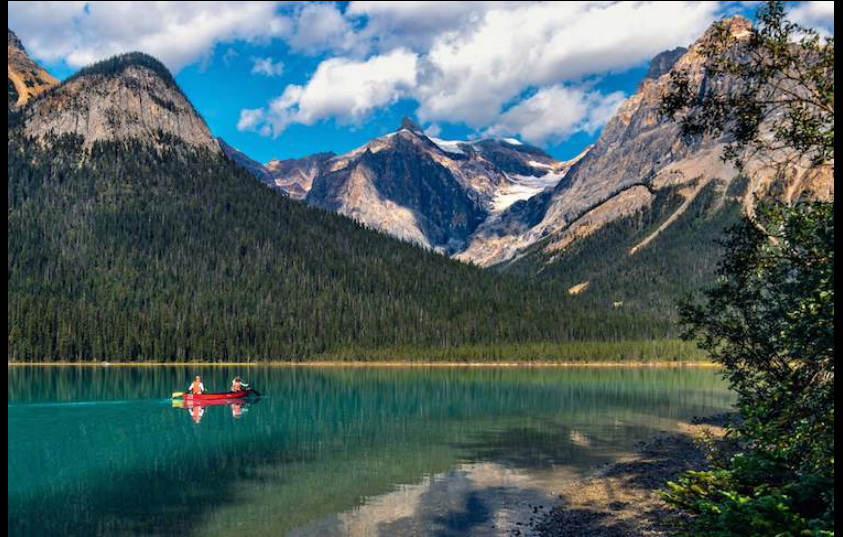
Alan Defoe Emerald Lake 2 nd place Advanced 89.5 points