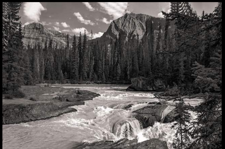
Alan Defoe Kicking Horse River 3 rd place Advanced 85.5 points