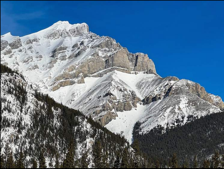
Lynda Corkum Banff Mountain View 1 st place Advanced 89.6 points