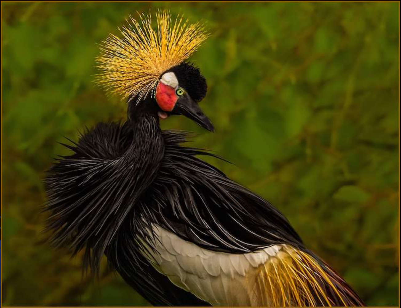
Greg Aldous African Crown Crane 1 st place Advanced 94.8 points