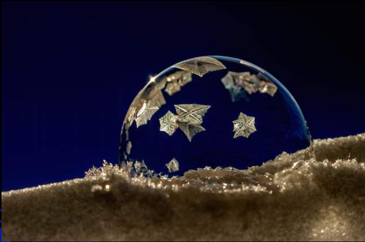
Laura Strilchuck Ice Bubble 3 rd place Advanced 86.5 points