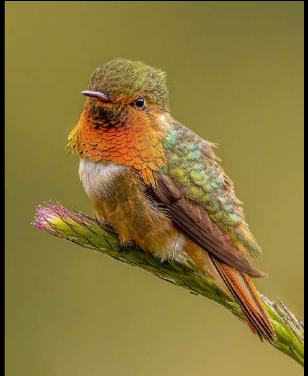
Scintillant Hummingbird 2 nd place Advanced 94 points