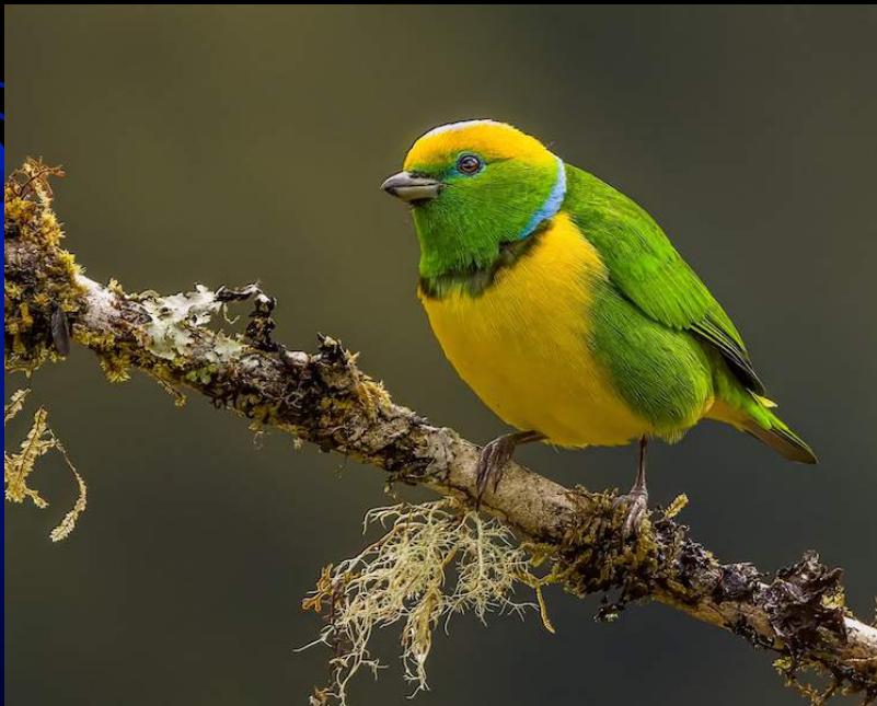
Gold Browed Chlorophonia 3 rd place Advanced 93.7 points