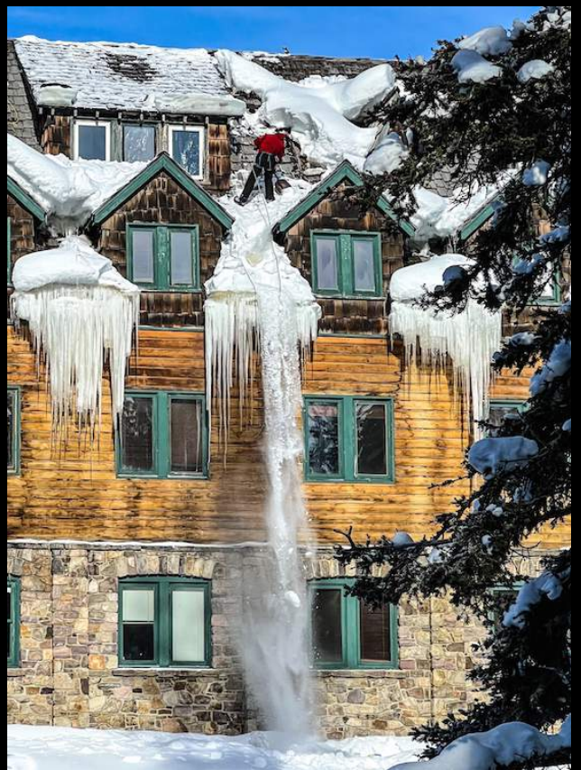
Lynda Corkum Shoveling off the roof 3 rd place Advanced 83.7 points