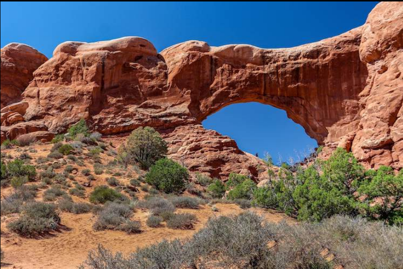
Alan Defoe Arches' South Window 3 rd place Advanced 86.3 points