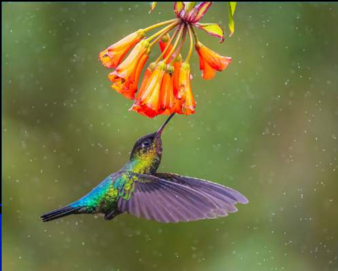
Doug Myers Fiery-throated Hummingbird 3 rd place Advanced 84.7 points