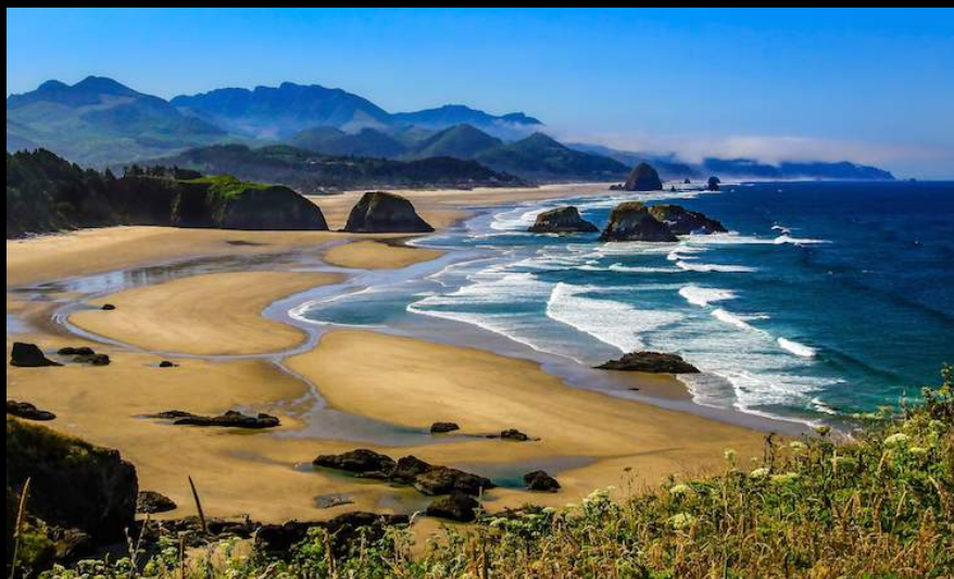
Alan Defoe Cannon Beach Morning 3 rd place Advanced 92.7 points