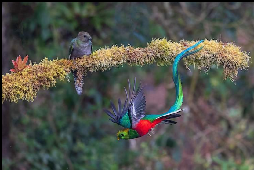
Male and Female Quetzels 3 rd place Advanced 95.7 points