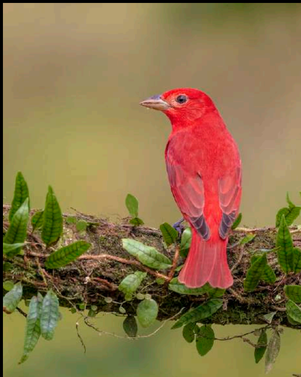
Summer Tanager 3 rd place Advanced 95 points