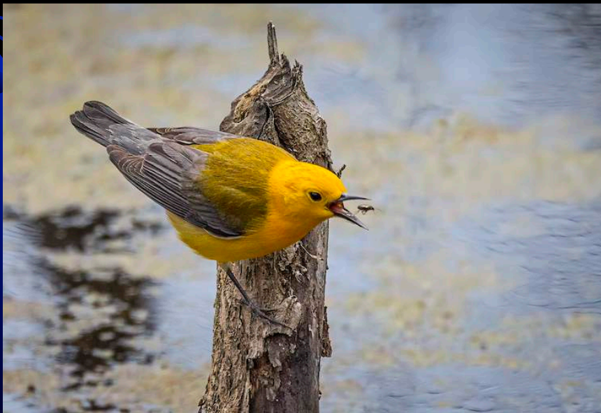
Prothonotary Warbler 3 rd place Advanced 87.1 points