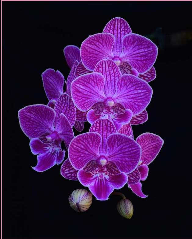
Darlene Beaudet A Little Pink 3 rd place Advanced 87.1 points