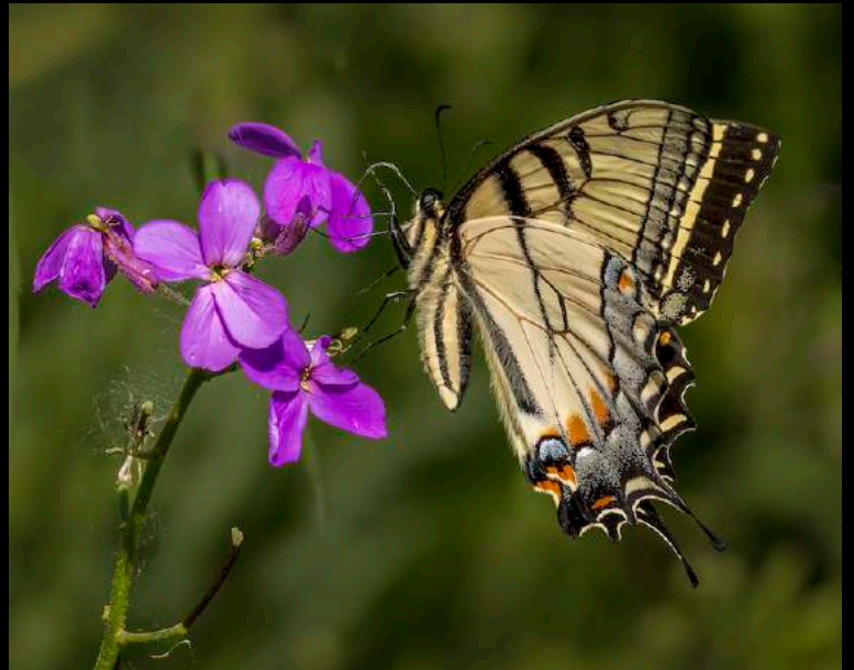
Eastern Tiger Swallowtail 2 nd place Advanced 88.8 points