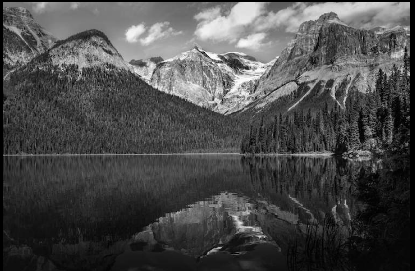
Alan Defoe Rocky Mountain Reflection 3 rd place Advanced 86.6 points