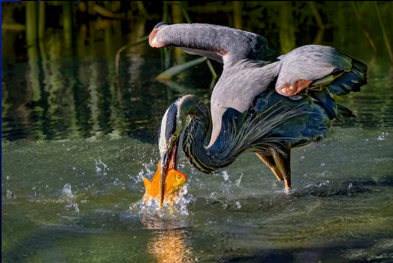
Norm Rheaume Great Blue Heron Catch 3 rd place Advanced 87.9 points