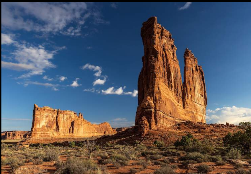
Alan Defoe Courthouse Towers Morning 2 nd place Advanced 87.3 points