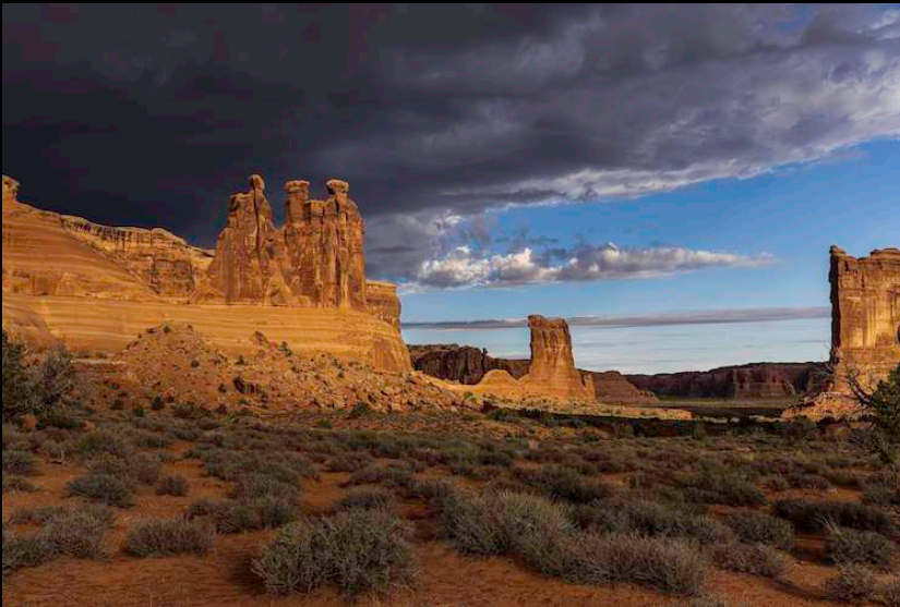
Three Gossips Stormy Morn 3 rd place Advanced 87.8 points