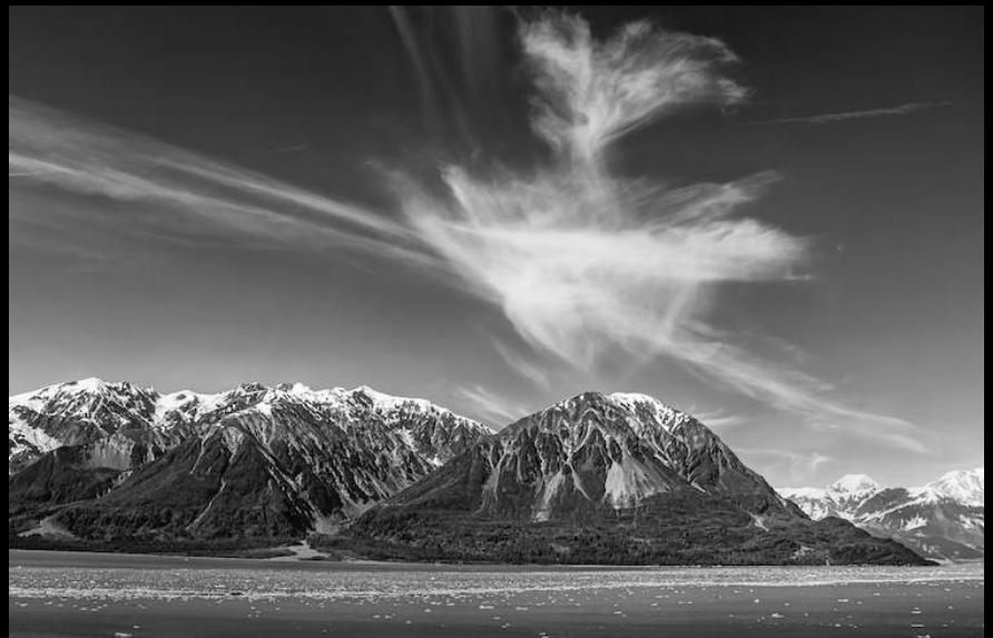
Cloud & Mtn Interplay 3 rd place Advanced 86.3 points