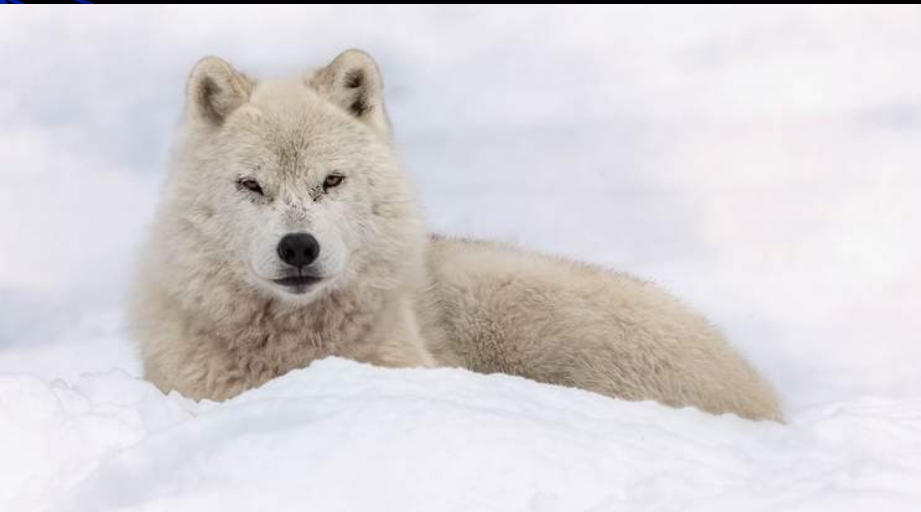
Arctic Wolf 3 rd place Advanced 88.5 points