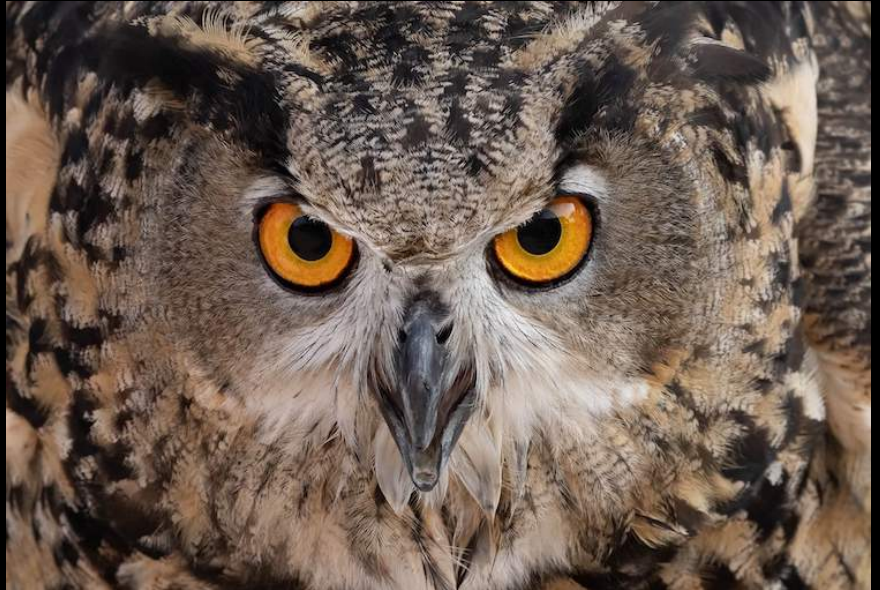
Eurasian Eagle-Owl 2 3 rd place Advanced 88.7 points