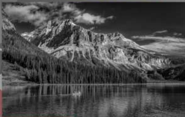
'Canoeing Emerald Lake Alberta' by Alan Defoe

2023 Four Nations Inter-society Competition