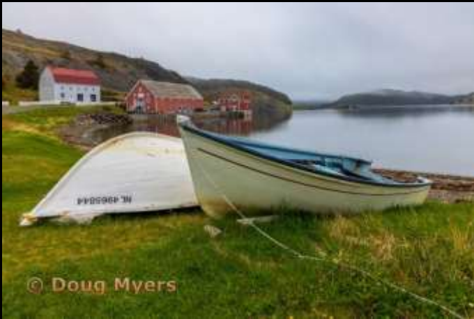
Doug Myers Bonavista Morning 3 rd Place Advanced 90.7