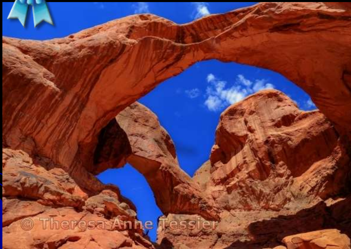
Theresa Tessier Double Arches 1 st place Advanced 93 points