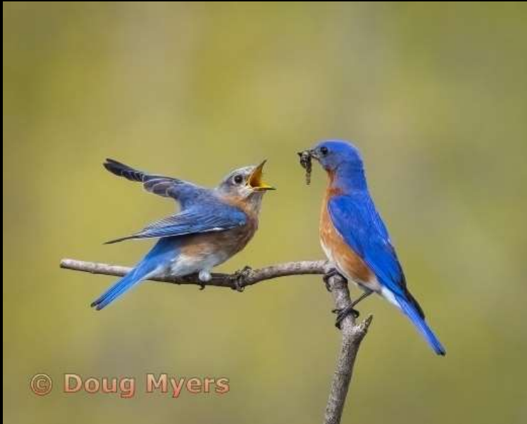
Doug Myers Blue Birds and Lunch 2 nd place Advanced 90 points