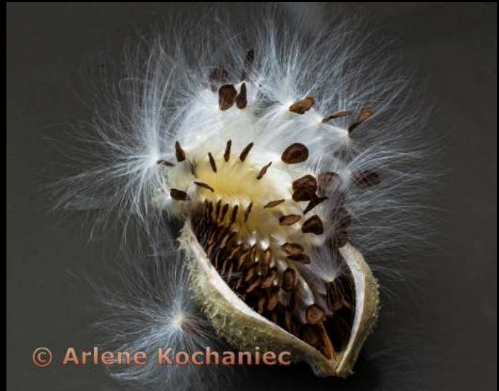
Arlene Kochaniec Exploding Milk Weed Pod 2 nd place Advanced 90 points