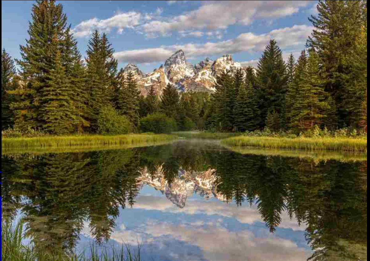
Teton Morning Reflection Alan Defoe 2 nd place Advanced 86.7 points