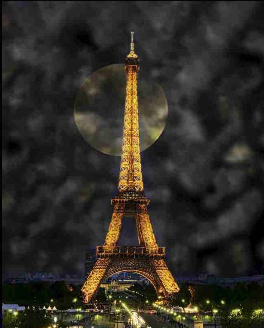
Willy VanAudenaerde Eifel Tower & Moon 2 2 nd place Advanced 86.0 points