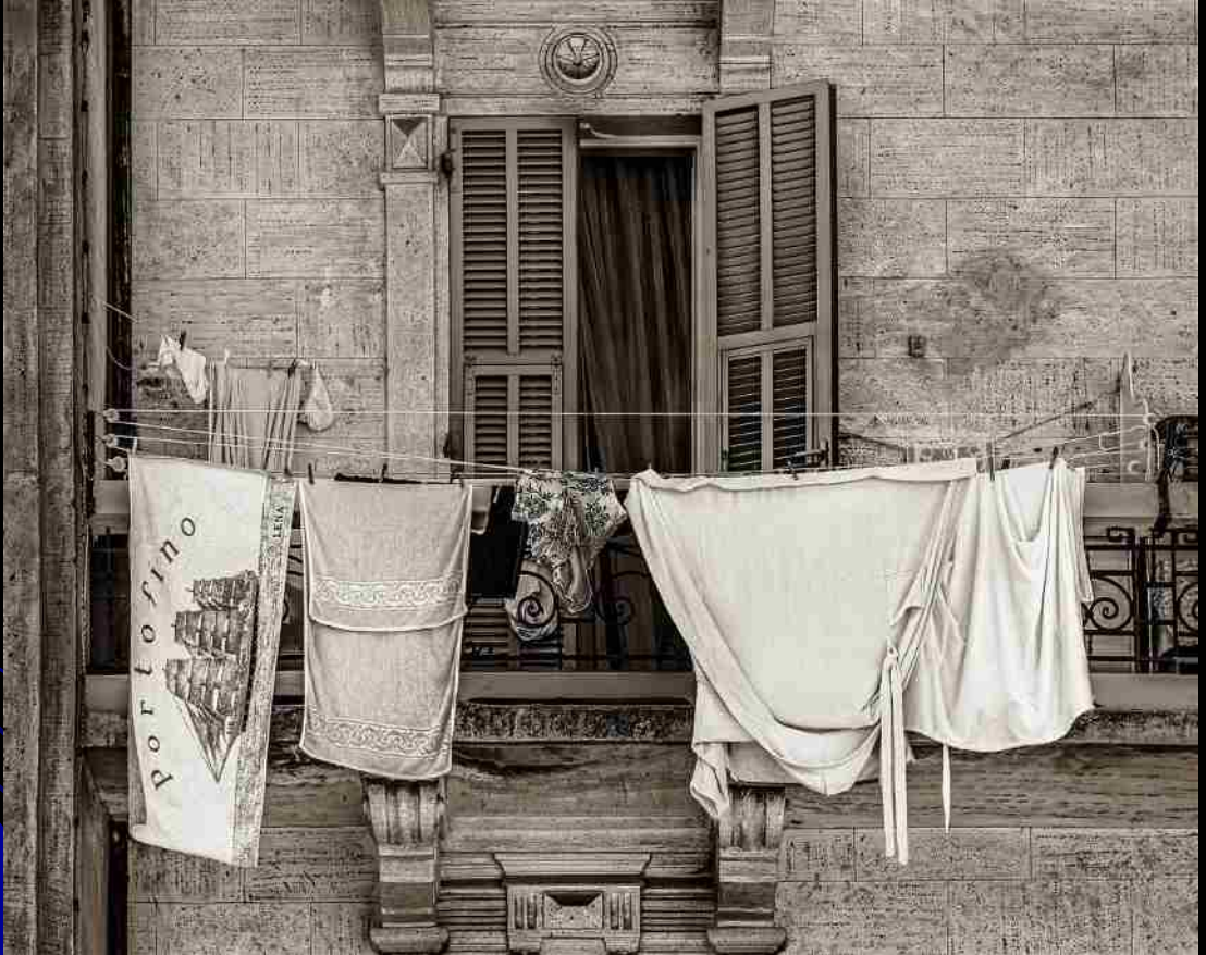
Greg Aldous Portofino Laundry Day 2 nd Place Advanced 83.7 Points