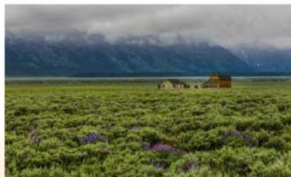
ALAN DYROR (CANADA) = FOCCY MOUNTAIN MEADOW MORNING =