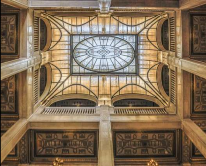
Doug Myers Book Building Detroit 2 nd place, Advanced 82.7 points