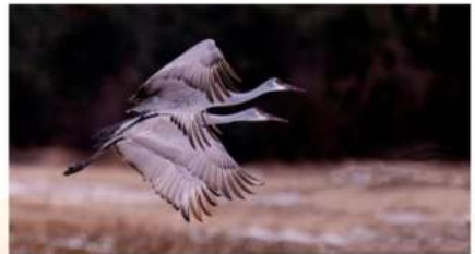
BRENT GRISH (CANADA) = SAGE-HILL CRANE IN FLIGHT =