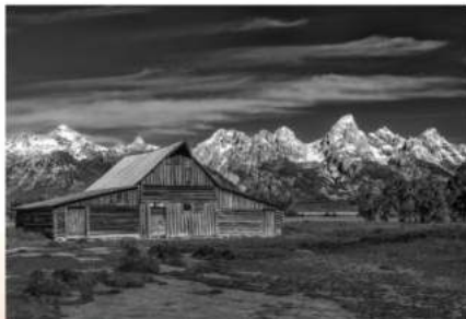
ALAN DIXON (CANADA) = MOULTON BARN, TETON MOUNTAINS =