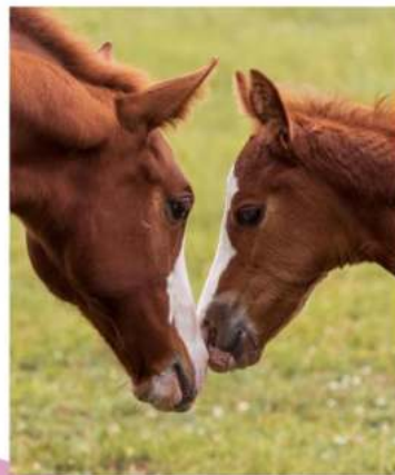
MARGOT LANGUE (CANADA) - SIBLINGS -

NOVEMBER 26, 2023 TORONTO, ONTARIO, CANADA