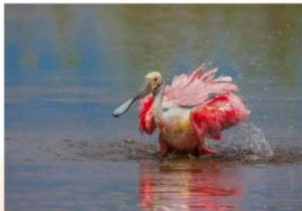
ALAN DRYDE (CANADA) - SPOONBILL BATHING -

NOVEMBER 26, 2023 TORONTO, ONTARIO, CANADA