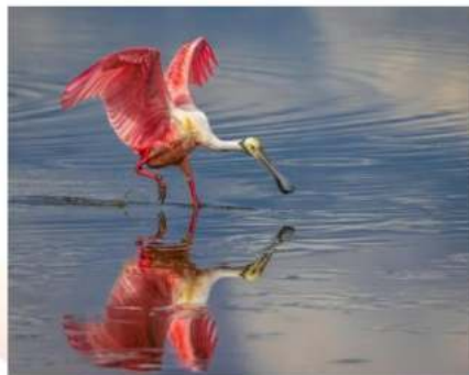
ALAN DIXON (CANADA) = ROSEATE SPOONBILL TOUCHDOWN =