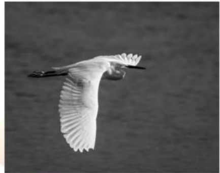
DOUGLAS MYERS (CANADA) = EGRET IN FLIGHT =