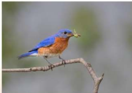
ALAN DYROR (CANADA) = EASTERN BLUEBIRD WITH PREY =