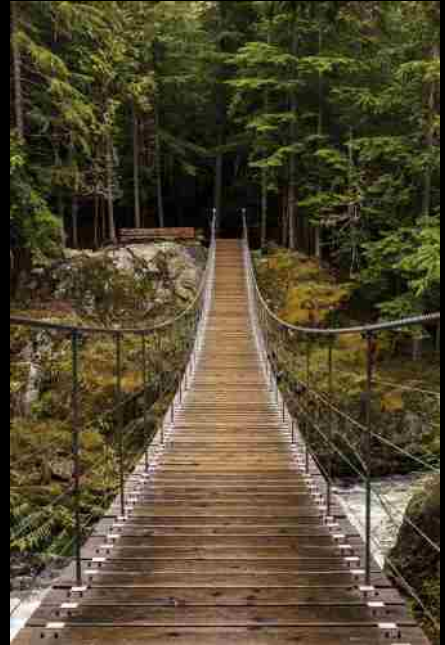
Katherine Beaumont Suspension Bridge HM 84.0 points