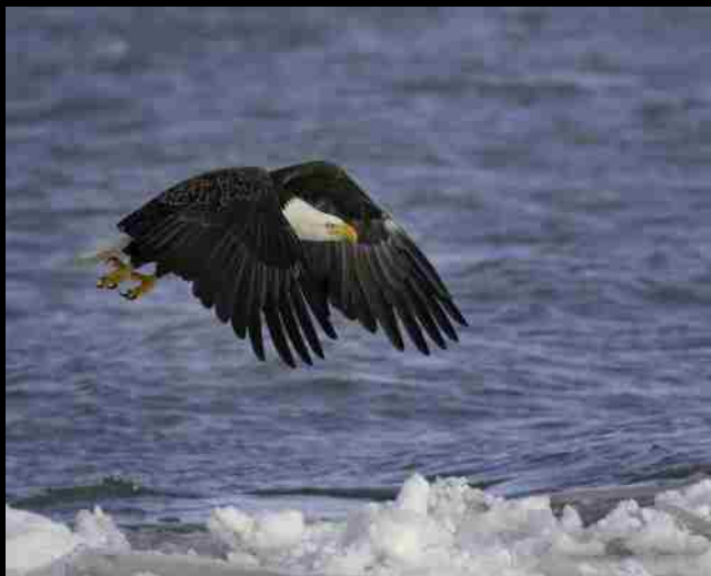
Brent Groh Bald Eagle in Flight 3rd Place, GOLD 87.5 points