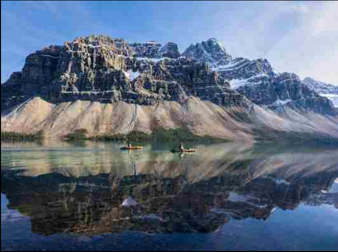
Simone Hobson Guiding Light 1 st Place, SILVER 85.3 points