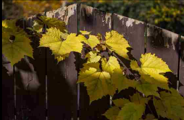
Brian Cowan Grape Vine 1 st Place, BRONZE 76.0 points