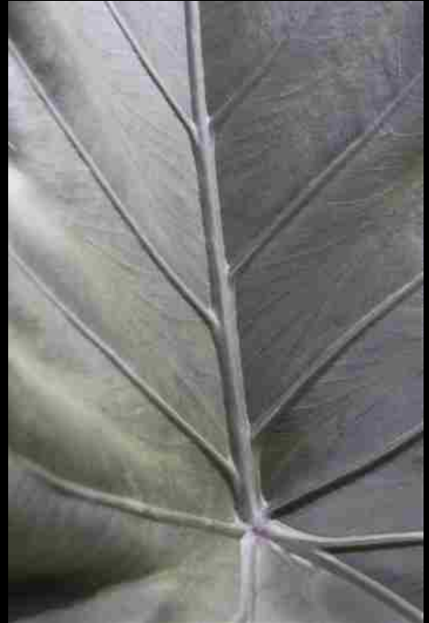
Brian Cowan Wintergreen 1 st Place, BRONZE 74.4 points