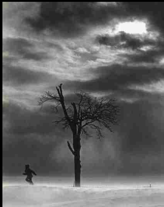
Brian Cowan Run 1 st Place, BRONZE 81.7 points