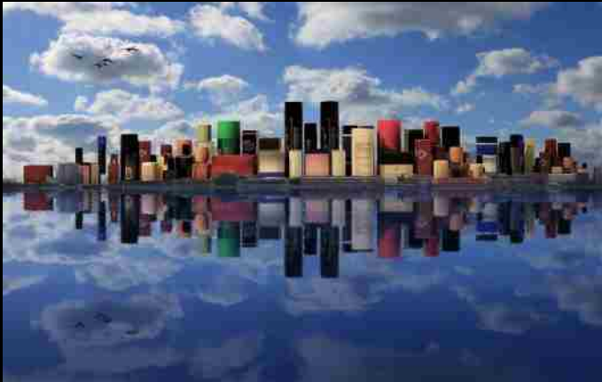
Brian Masters Toiletory Towers 1 st place, GOLD 87.7 points