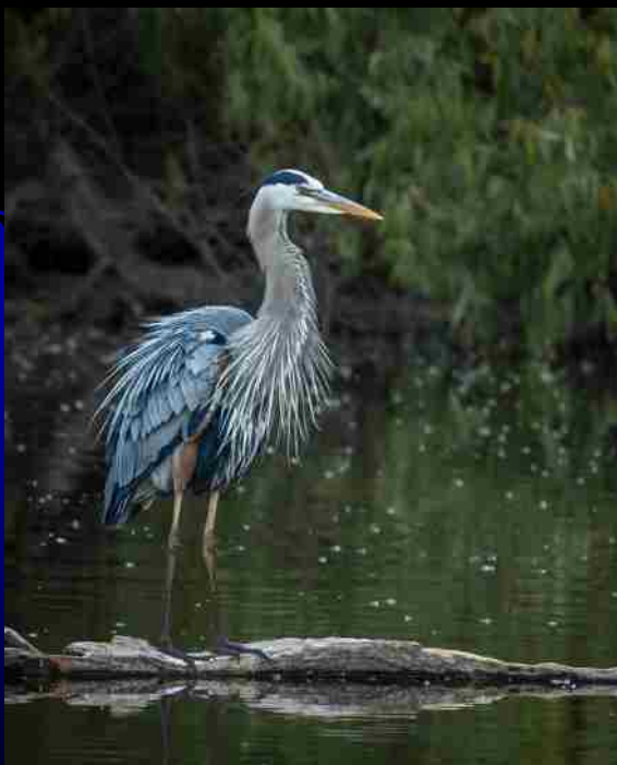
Caroline Tanchioni Great Blue Heron 2 nd place, SILVER 86.3 points