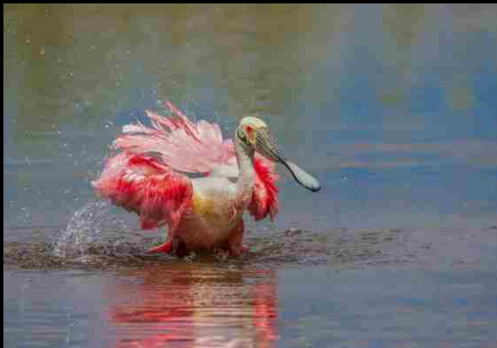
Alan Defoe Splashing Spoonbill 2nd Place, GOLD 90.0 points