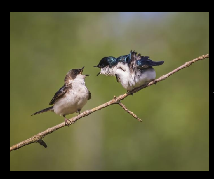
Doug Myers Tree Swallow Dispute 2<sup>nd</sup> Place, GOLD 84.7 points

Brent Groh Pouncing Golden Eagle 2<sup>nd</sup> Place, GOLD 84.7 points