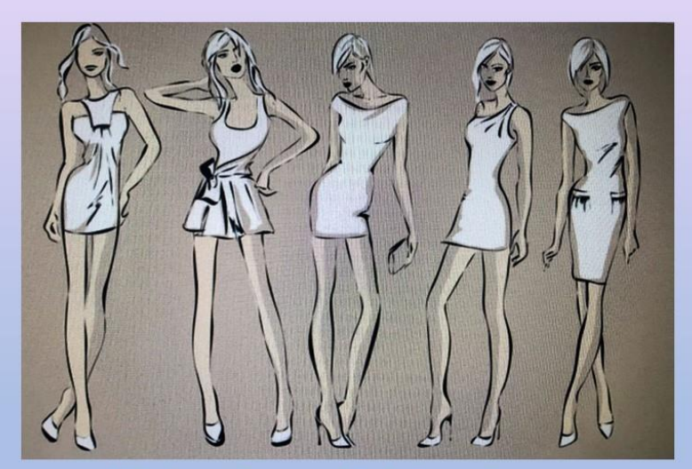
Windsor Camera Club June Program

Please follow us on Facebook for any changes due to inclement weather